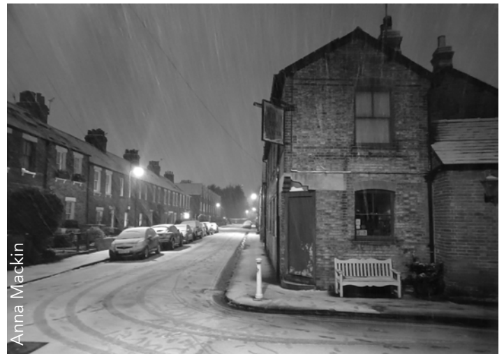
▲ South Street on 4 January

Outside of work, I cannot get enough of exploring the countryside on my bike. Cycling here is a joy compared with London. I also enjoy swimming in Hinksey Lake, which reminds me of my childhood in Bratislava, Slovakia. And when I occasionally miss Slovak food, I go to a Slovak restaurant, Moya, and the Tumbling Bay cafe is run by a Slovak couple. Oxford really has everything.