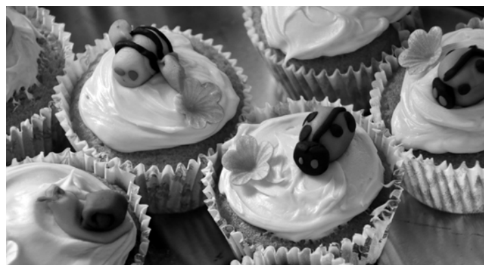
▲ Tea on the Towpath