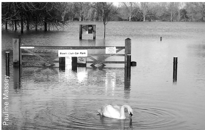
▲ Botley Park in November's floods

We meet in the foyer of West Oxford Community Centre every Monday at 1 p.m. The walk lasts up to an hour, followed by a cuppa and biscuit back at the Centre. The conversation is as easy-going as the terrain, and it's a treat to share sightings of cormorants, moorhens and (far more athletic) locals jogging past. The walks are under the auspices of the Ramblers Association, with the leaders trained to accommodate everyone's pace and mobility. There is no commitment or cost, and it's a delightful way to get moving in company. For further details contact lambert3323@gmail.com or just turn up.